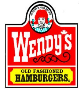
905 18th Street, Brandon www.wendys.ca