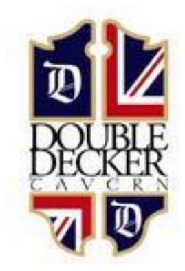
903 Rosser Avenue, Brandon