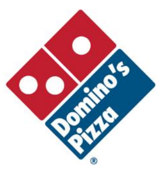
824 18th Street, Brandon www.dominos.ca