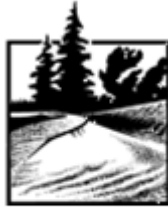
Spruce Woods Park