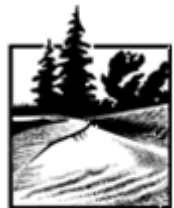
Spruce Woods Park